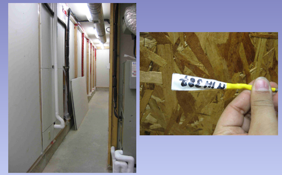
Top: The annular space of the control building and a humidity sensor. Below: The sensors that are to be installed into the wall panel. From left to right: moisture pins and temperature, mould sensor, moisture wafer, installed sensors.