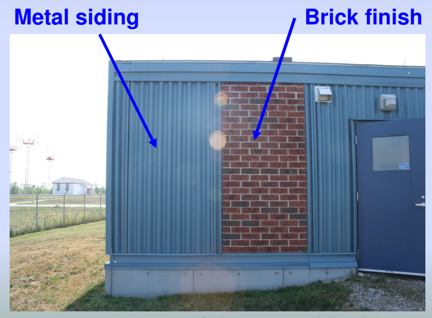
Exterior view of the control building