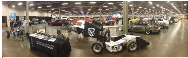
The Speed and Custom Car Show

To increase our visibility in the local motorsports community for both the team and our sponsors, Western Formula Racing took part in both the Speed and Custom Car Show and the Plunkett Fleetwood Country Cruize In. It was a great opportunity to meet people from around Ontario with similar interests in the automotive industry and motorsports in particular. We may have lacked some of the heritage of the classic Cadillacs cruising around but we did not lack the passion for our car.