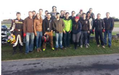
The karting team