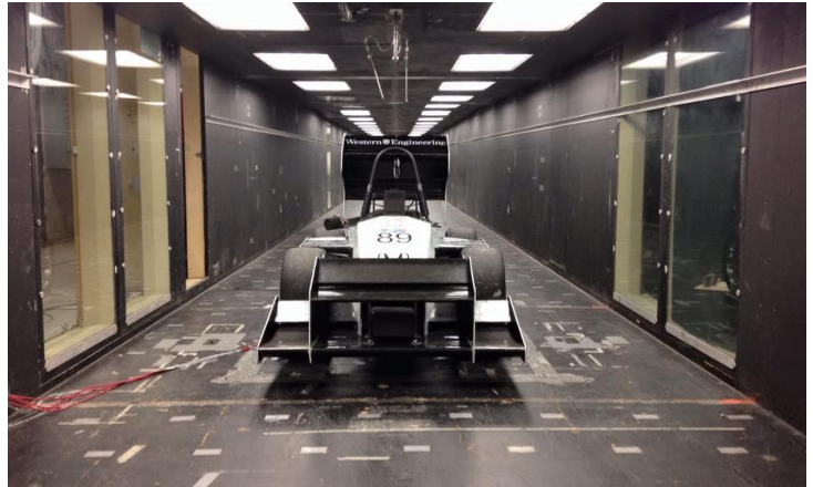
The 2015 car in the Boundary Layer Wind Tunnel

An area of innovation on the 2015 car was the aerodynamic package. The team explored the use of upper-decker wing elements, side pod wings, and a drag reduction system that could change the angle of the wings while in motion. In addition, for the first time Western Formula Racing had the opportunity to use the Boundary Layer Wind Tunnel on campus to test and validate the aerodynamic design of the vehicle. The testing day was as intense as it was useful and the data gathered helped validate the simulation that the aerodynamics team had spent many long hours developing.