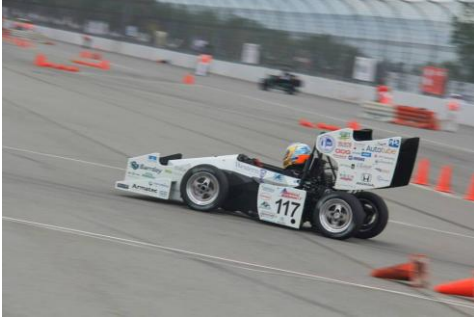
2015 car at Michigan International Speedway

However, these results don't mean the season was without hiccups. We lived by the phrase "It ain't over till it's over" and showed tremendous drive and persistence to overcome challenges encountered at each competition. More on challenges later, but suffice it to say we never anticipated we'd be rebuilding a suspension system overnight mid-competition, or rebuilding an engine the night before a grueling endurance event.