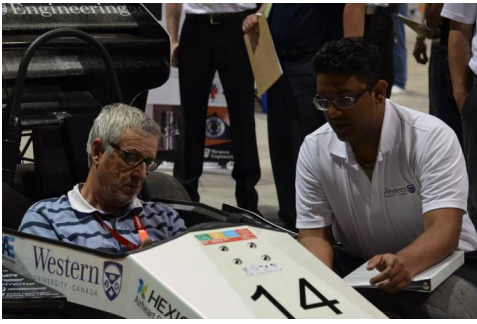
Judging at Formula North

Perhaps the accomplishment the team is most proud of is qualifying for design finals at both Formula North and Lincoln. This demonstrated that not only are we fast, but that we understand why we are fast, and what we need to do to get even faster. We were also described by one of the head judges at Formula North as “The 100-80 team”. You have developed 100% of the car 80% of the way to perfection ”. This statement really resonated with us and we are very proud that our team has developed as a whole. We understand that there is lots of room for improvement and that motivates us to work harder.