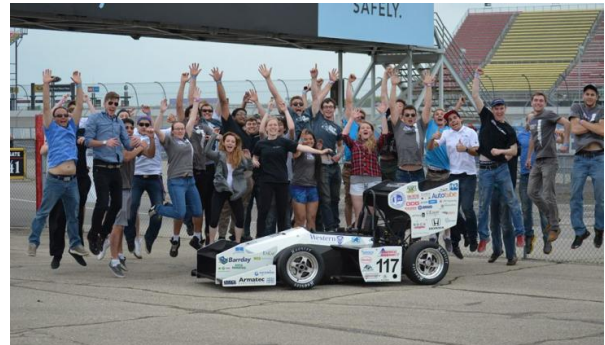
The team celebrating the Michigan Results

WFR was very pleased to finish tenth overall in a field of 118 teams at Michigan, the largest FSAE competition. It was the first event of the 2015 season, and the fast autocross course layout represented our first chance to test the car at high speeds. It immediately became apparent that the aero balance was causing some high speed instability but our vehicle dynamics team was able to devise an effective solution in short order. The car worked like a charm and managed to finish 8th in endurance , notwithstanding some significant time penalties which pushed the team out of 4th place. The team was extremely proud of this finish and of the proven reliability of the car. Michigan 2015 was also the first time our team got more than 100 points in design; a clear indicator of things to come in the season!