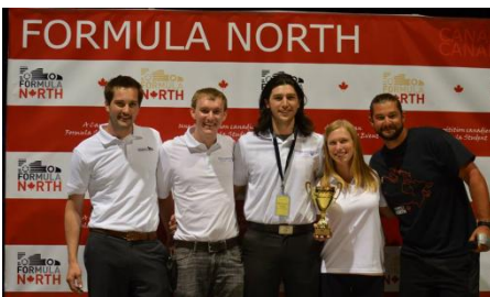
Awards Presentation at North

Formula North is a local competition held in Barrie, Ontario featuring many of the top teams from across Canada and the Northern United States. Our team was excited to finish second overall in a field of 19 cars! This competition was also the first time WFR made design finals in the history of the team! However, things took an interesting turn during the autocross event, just before design finals. After putting down the third fastest lap of the day on just our first run, the rear left suspension broke. Ironically, as a result the car had to roll up to design finals with "3 legs". Embarrassing as it was, the team still managed to place second in the design finals. Immediately after, a crew of 12 team members drove back to London and worked through the night to build a completely new suspension system. They returned to Barrie with just enough time to assemble it on the car and get ready for endurance. Remarkably the team managed to win the endurance event , cementing our 2nd place finish in the competition!