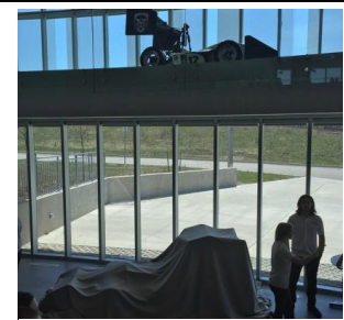
The 2015 car about to be unveiled

This year Western Formula Racing held an unveiling event to showcase the new car and to officially kick off the 2015 racing season . The event was held at the Collider Building in the Advanced Manufacturing Park, right here in London Ontario. The event was very well-attended by sponsors, supporters, media, alumni, faculty, friends, and family who were all finally able to see what the team had been so diligently working on for the past year.