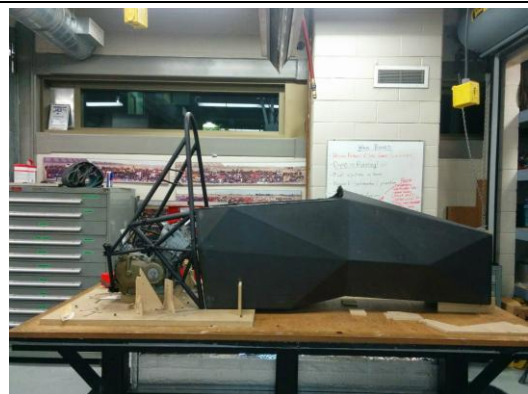
The monocoque out of the mold!

The 2015 race season marked the team's foray into structural composites with our very first carbon fibre monocoque chassis. The team was thrilled with both the fit and finish of the monocoque, which simultaneously reduced mass and increased stiffness relative to the 2014 design. It is also interesting to note that we used the unique fabrication method of infusion which allowed us to do all fabrication work in-house while producing high quality parts.