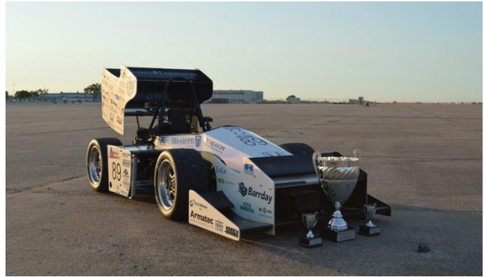
The Lincoln Hardware

WFR was thrilled to finish second in a field of 79 teams in its first appearance at the Formula SAE Lincoln competition. It was also the team's first experience driving on a concrete surface, which we soon learned provided superior grip compared to the typical asphalt. The extra grip helped us pull over 2.5 lateral g's during autocross and put down a skid time of 5.068! However, the most impressive aspect of WFR's performance wasn't the max g's, but