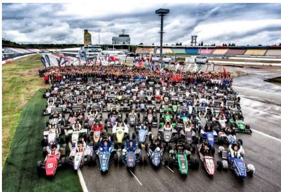
All of the teams at FSG 2015

However the team managed to stay optimistic and effectively resolved these issues within the serious time and technical constraints of competition, resulting in an incredible international showing . Special thanks to Dynamics e.v. and Regenics at OTH Regensburg for hosting us before and during the competition.