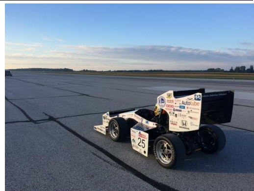
The 2015 car looking in to the distance

The 2016 season is already fast approaching. Design of the 2016 car is now underway and the excitement and anticipation of another racing season is already starting to build around the shop. The 2016 design will focus on improving mass properties, modifying engine internals, and developing and validating simulations. It will be a great year to improve upon a proven car and to develop an even stronger team. Stay tuned to see what Western Formula Racing has in store for the coming year.