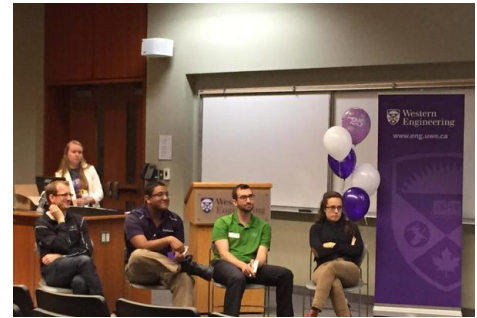
WFR at Discovery Western’s Dragon’s Den program

Helping build a positive engineering community and giving back to Western has always been a passion of the team. This year WFR was happy to help Western Engineering promote science and engineering to high school and elementary students in and around London. As an example, the team hosted the Thames Valley Physics Teacher Panel, and participated in judging a Discovery Western competition. The team was also actively involved with the University to help increase the participation of women in engineering fields. Working with Discovery Western’s Girls Club and Engineering’s Go-Eng girl have been incredible opportunities to further this cause, and the team is looking forward to more events like these in the upcoming season.