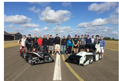
WFR with our hosts Dynamics e.v.

WFR finished sixth in a field of 110 teams at Formula Student Germany, the most prestigious Formula Student competition in the world. Skidpad was the first dynamic event in Germany, but it was unlike any event the team had seen before. This track was intentionally soaked wet by a sprinkler system to reduce grip and create a greater driving challenge. On the very first lap, with no prior wet driving experience, our driver managed to put down a lap good enough for 6th place in the skidpad event . Like many of