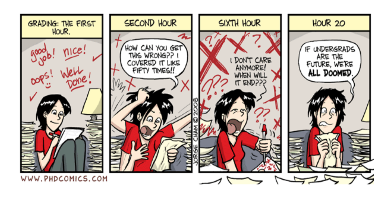
Do you enjoy marking?