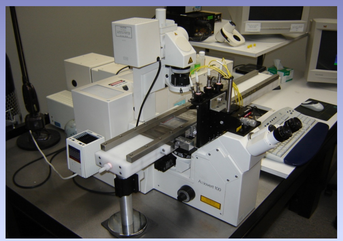
Hemo-dynamic rig mounted on the Laser Scanning Confocal Microscope (LSCM) stage