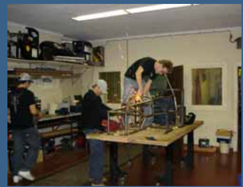
Hard at Work on the 2005 Chassis