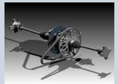
2005 Drive Train