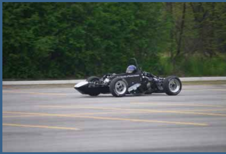
Testing of the 2004 car at Springette parking lot.